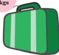
GSKSMO Trip Trip TBA in December - watch our Facebook page!