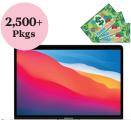
Apple MacBook Air OR $750 Cookie Dough