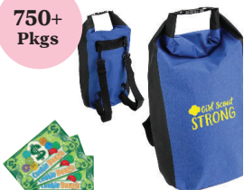
Dry Bag Backpack OR $5 Cookie Dough