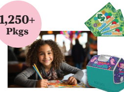
Painting Party* OR $75 Cookie Dough *Painting Party includes lunch and drinks in a cooler you take home! Dates/Locations TBD