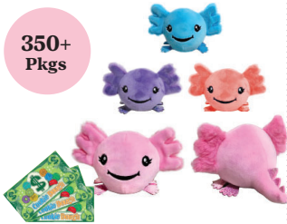
Squeezeie Axolotl OR $5 Cookie Dough (one per girl, color may vary)