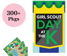
Girl Scout Day at The K, June 9, 2024 OR $35 Cookie Dough