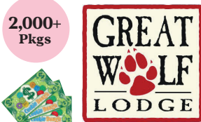
Great Wolf Lodge Overnight* OR $250 Cookie Dough *Overnight stay for four at Great Wolf Lodge, Kansas City