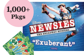
Newsies at the New Theater Restaurant* OR $75 Cookie Dough *August 10th matinee