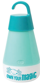
Mood Mixer Light