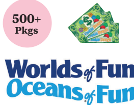
Girl Scout Day at Worlds of Fun, July 13, 2024 OR $50 Cookie Dough