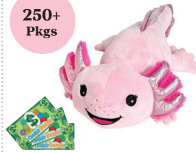
Axolotl Plush OR $5 Cookie Dough