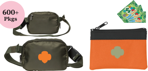
Belt Bag AND Coin Purse OR $10 Cookie Dough