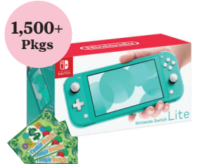
Nintendo Switch Lite OR $175 Cookie Dough