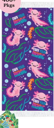
Beach Towel OR $10 Cookie Dough