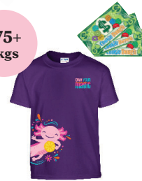
T-Shirt OR $5 Cookie Dough